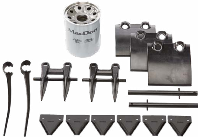
*Note: 279097 pictured above